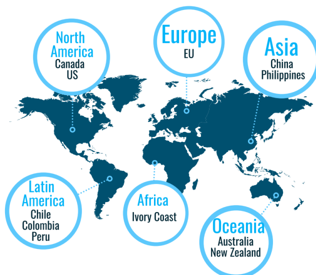
Figure 1 Global registration status for Revysol® as of October 2020 (C4)