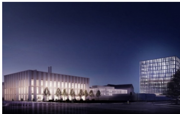
An impression of the new Science hub adjacent to the world class Duncan-Rice library.

We anticipate further investment of GBP12.3M from TauRx in 2021 for further research in the Department developing new improved drugs for Alzheimer's disease (five years of 25 PDRFs, chemicals, consumables and new equipment).