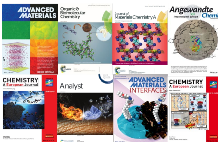
A selection of journal covers from Chemistry research at Aberdeen.