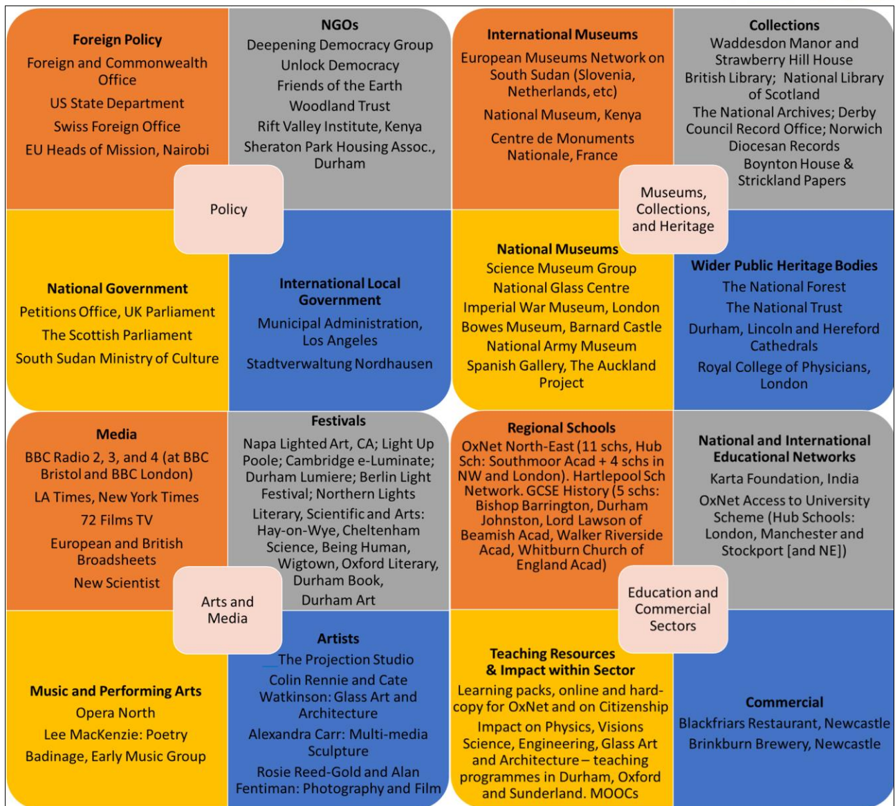
Figure 1: Impact & Engagement activities

The Department’s five Impact Case Studies reflect its continuing and well-established research strengths in medieval history and African history, as well as the comprehensive nature of its induction processes for staff appointed to new posts in the period of staff expansion since 2014. Four case studies come from staff who were in post before REF2014, while one is from a new appointment in the History Department.