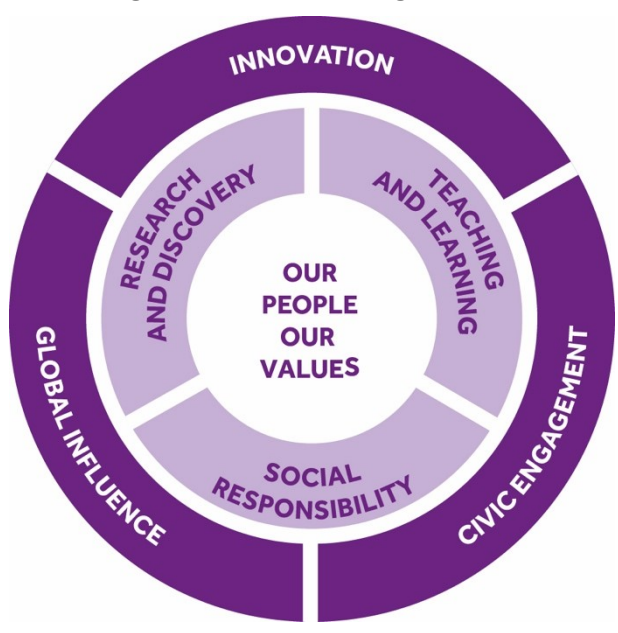
Figure 1 – Our Strategic Goals

Our strategic goals are research and discovery, teaching and learning, and social responsibility. Running through our goals is an emphasis on innovation, civic engagement and global influence, all driven by our people and underpinned by our values (Figure 1). Our vision is "to be recognised globally for the excellence of our people, research, learning and innovation, and for the benefits we bring to society and the environment".