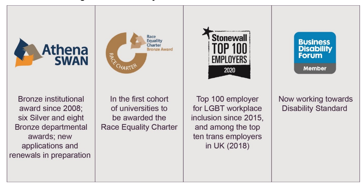
Figure 4 - University of Manchester EDI accreditations

Our Dignity at Work policy for staff and students implements zero tolerance of discrimination, harassment or bullying, supported by our specialist team and reporting channels.