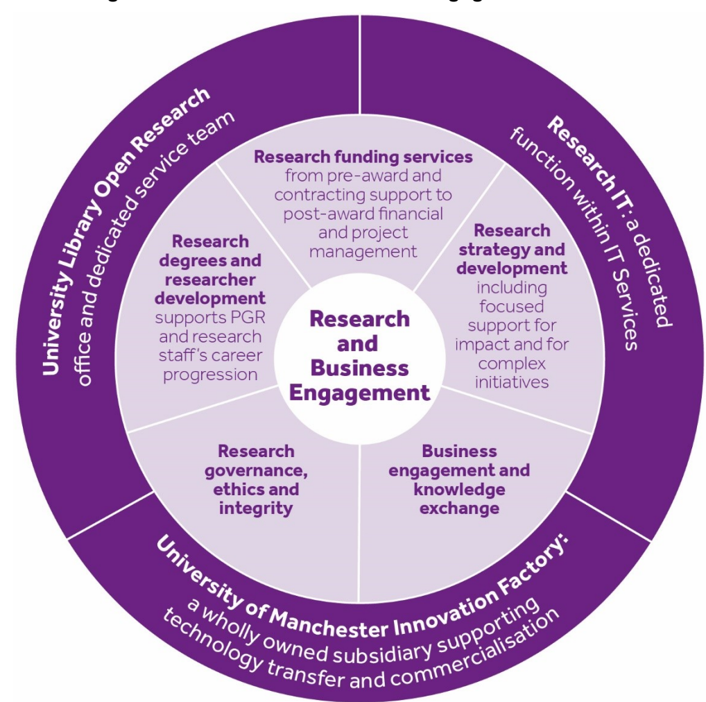
Figure 7 - Research and Business Engagement Services

Our University Statement of Research Expectations commits to providing services and infrastructure to enable researchers to secure external research funding. This commitment has helped deliver growth in our research income and market share over the REF period, accompanied by significant UKRI income in-kind; with our interdisciplinary research institutes and other collaborative vehicles driving much of this success (Section 2.ii-iii).