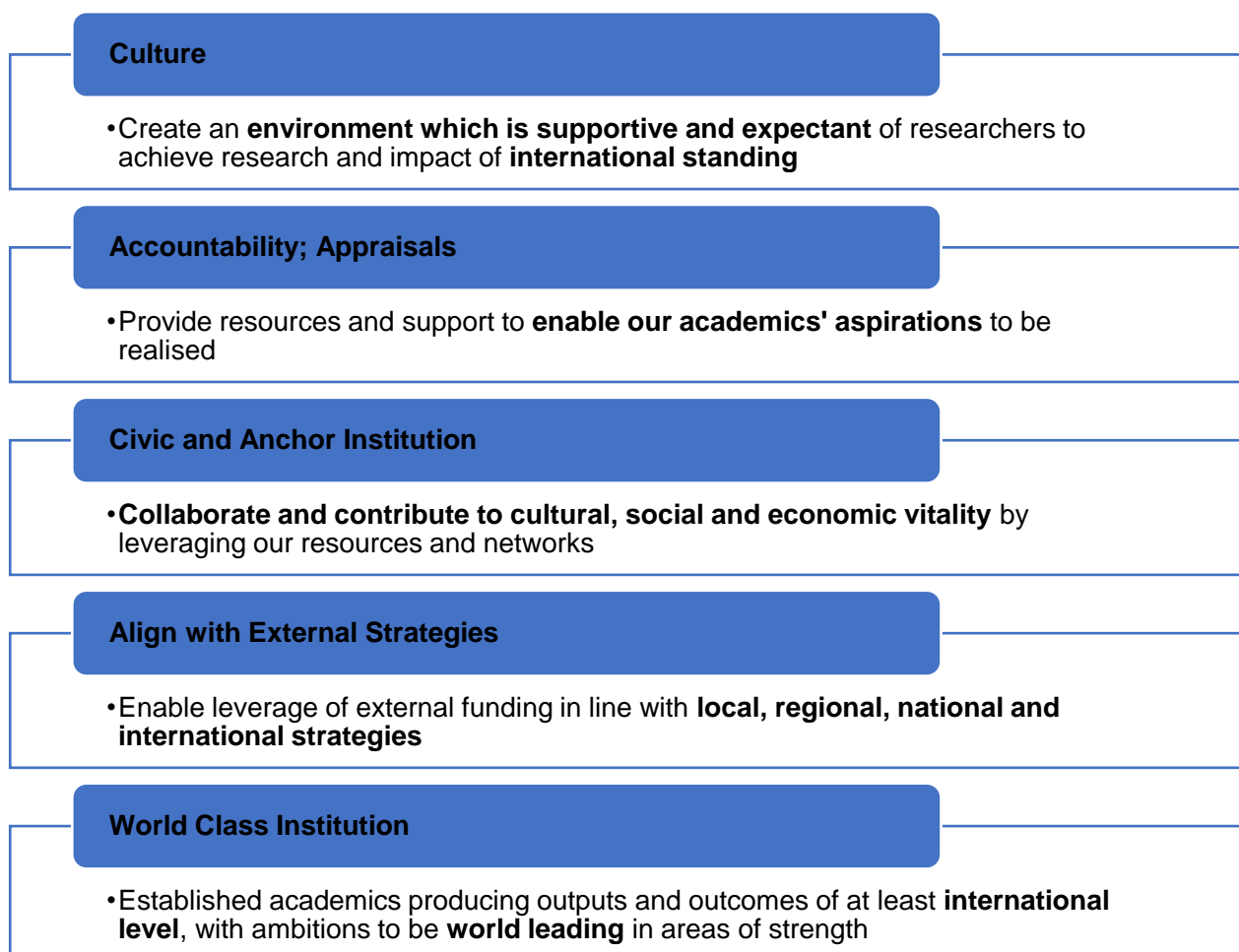
Figure 3. Future strategy - five areas of focus

Our new strategy will be delivered through: